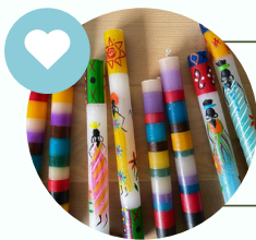
Thumbprint Artifacts South Africa

Maadilli Collective works directly with two cooperatives of women in Central and Western Uganda. With a mission to help vulnerable women by providing opportunities for income, our weaving partners sell crafts both locally and internationally. In addition to earning a fair income, women are also provided education about personal health, family planning, hygiene and HIV/AIDS. Maadilli Makers create horn keyrings, jewelry and ornaments as well as hand towels and woven items.