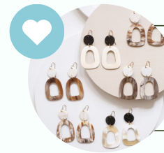
Maadilli Collective Uganda

Likha's mission is to empower Filipino artisan families to overcome poverty by reimagining time-honored local craft for the global marketplace. They feature a collection of sustainably-sourced, ethically-made pieces ranging from home décor to fashion accessories. Their products are crafted from natural, eco-friendly materials including natural straw and plant fiber, coco coir, sustainably-sourced shells, and recycled wood.