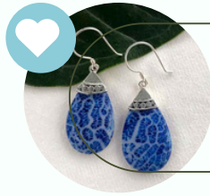
Women's Peace Collection Latin America, Africa and Asia

Thumbprint artifacts was conceived by two lifelong friends who wanted to recognize the entrepreneurial spirit by opening a new market for several fairly traded artisan companies in South Africa. They offer unique, high-quality, fair-trade home decor items that are hand made in South Africa. As every thumbprint is unique, so are these inspirational artisan products.